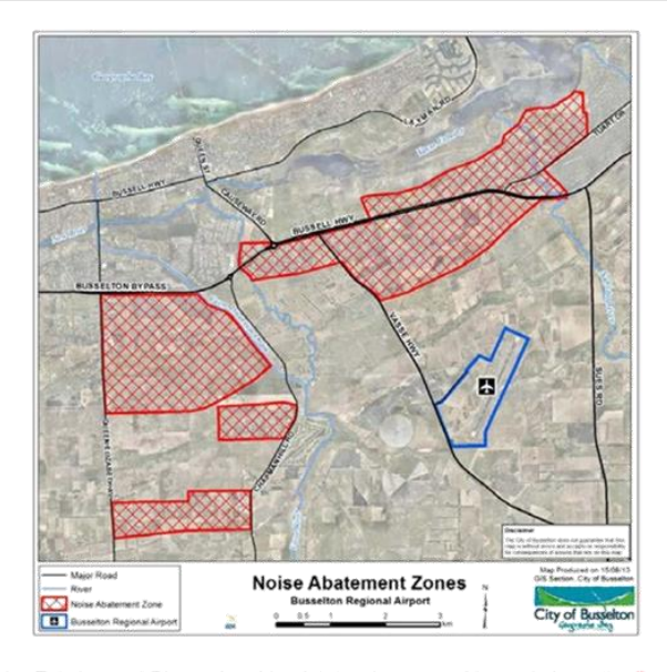
Figure 1 – Existing and Planned residential development with proximity to the <u>Busselton-Margaret</u> <u>River Regional Airport</u>

Noise abatement zones will be recognised in any future development of flight paths.