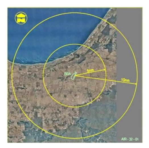
Figure 2 - 5nm and 10nm boundaries