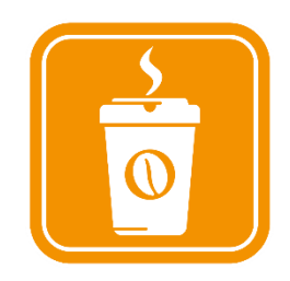
Lifestyle A place that is relaxed, safe and friendly, with services and facilities that support positive lifestyles and wellbeing.