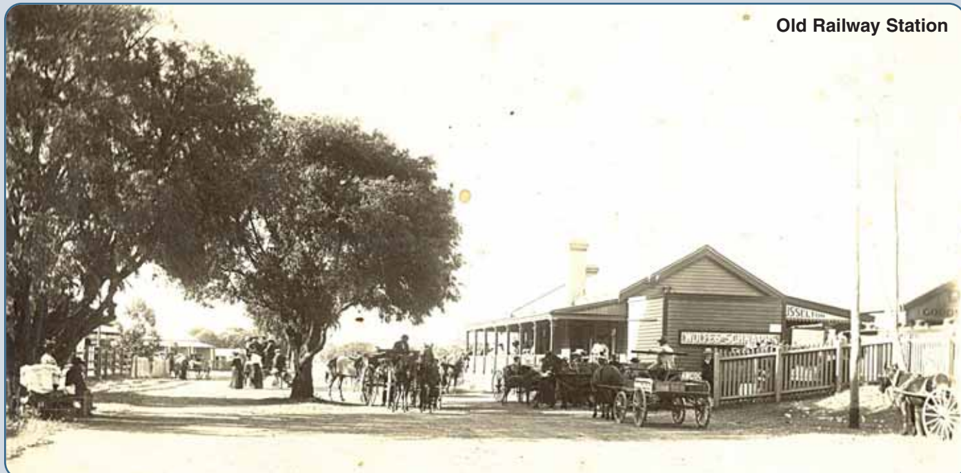
Old Railway Station

Please bring copies of any photos or information with you.