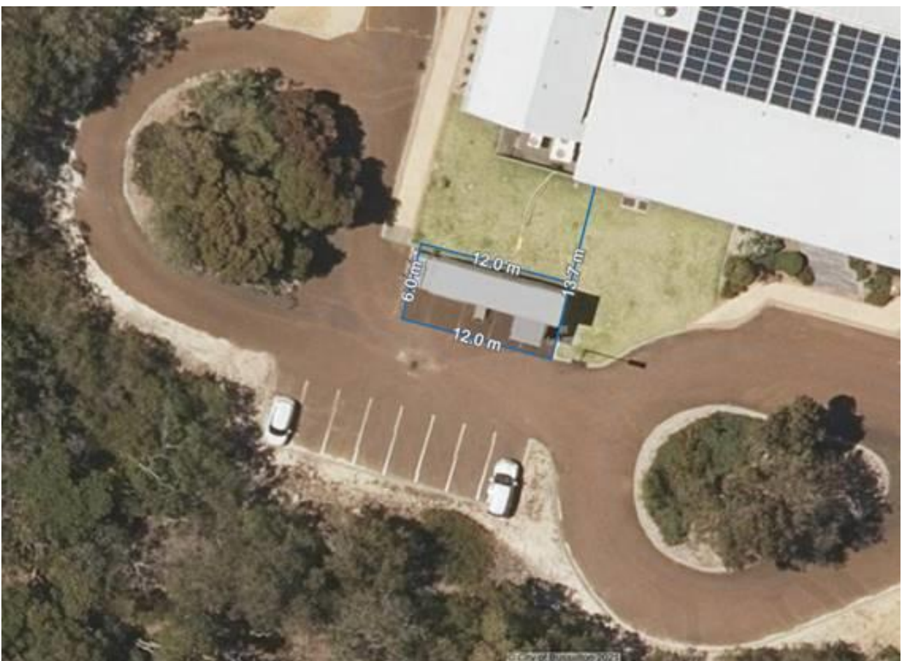
Image: Site Map

The proposed location is on the NCC site to enable the Dunsborough Youth “Shift Crew” to have access to the NCC facilities (gym, toilets, commercial kitchen) for events, activities and workshops.