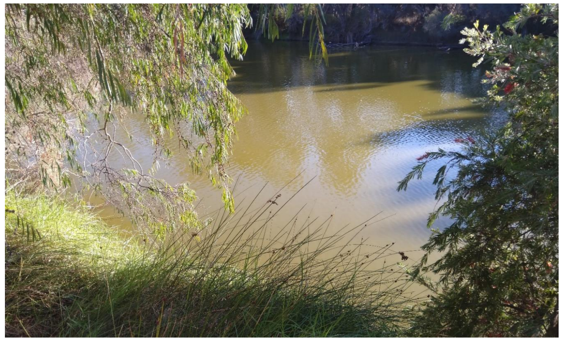
Figure 1 Lower Vasse River near City of Busselton council buildings, May 9, 2022. Note the highly brown-green colouration of the water, indicative of eutrophic conditions, but no apparent surface-reaching cyanobacteria blooms at the time.