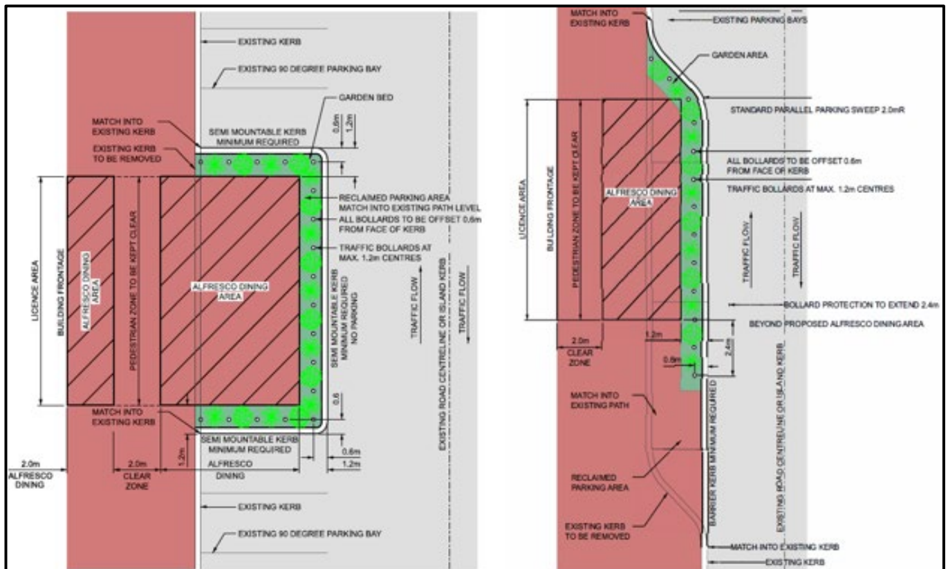
Reclaimed 90 Degree Parking