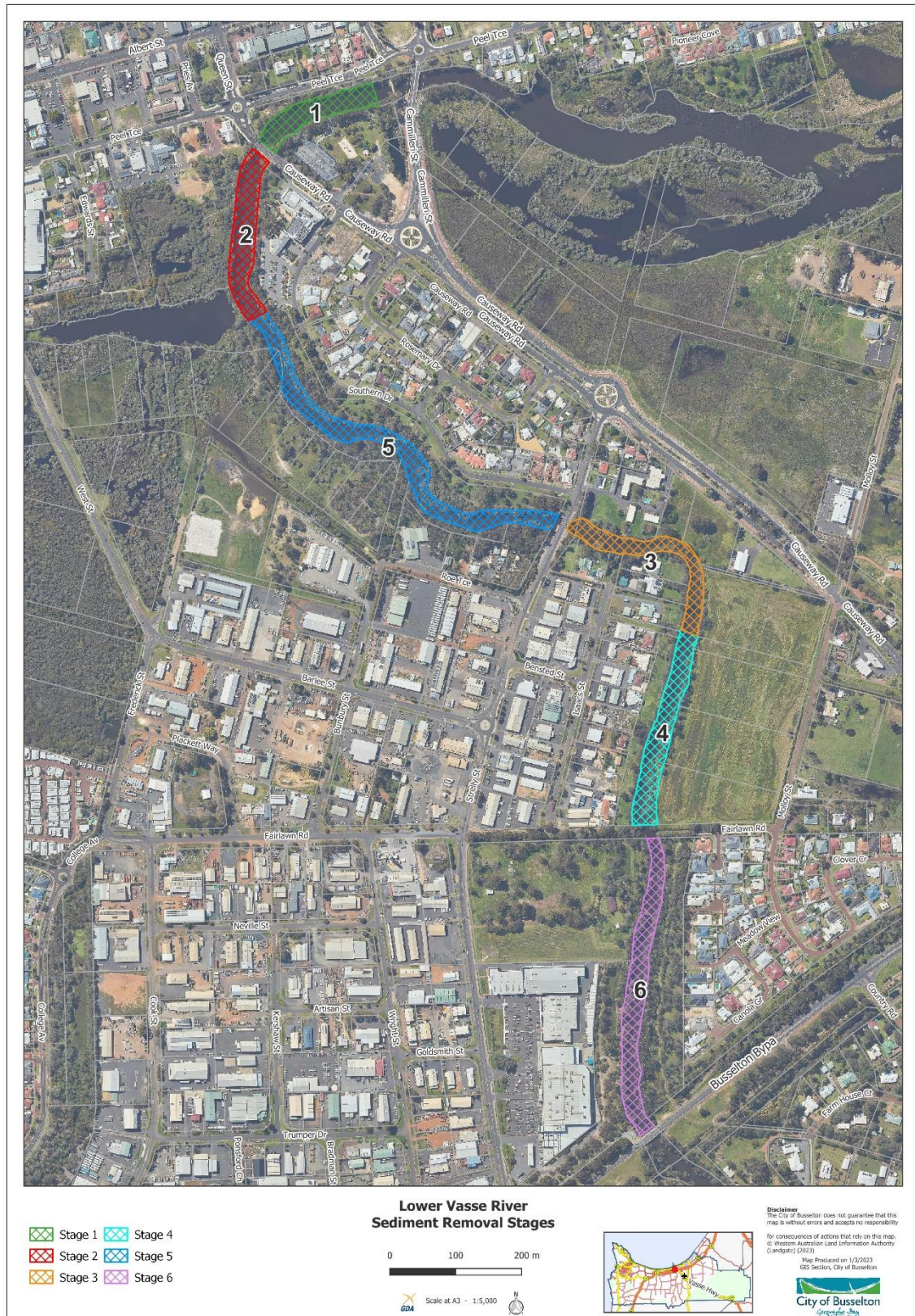
Figure 1: Staged sediment removal program in the Lower Vasse River