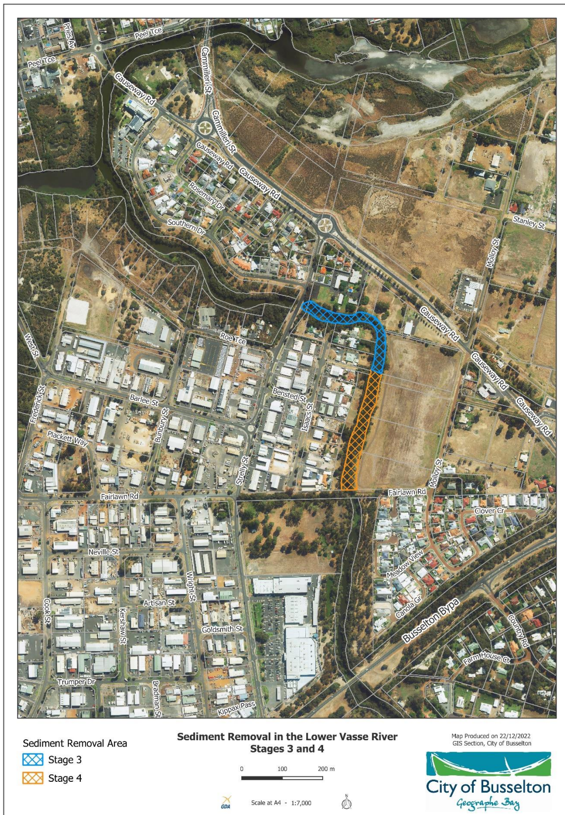
Figure 2: Sediment Removal in the Lower Vasse River, stages 3 and 4