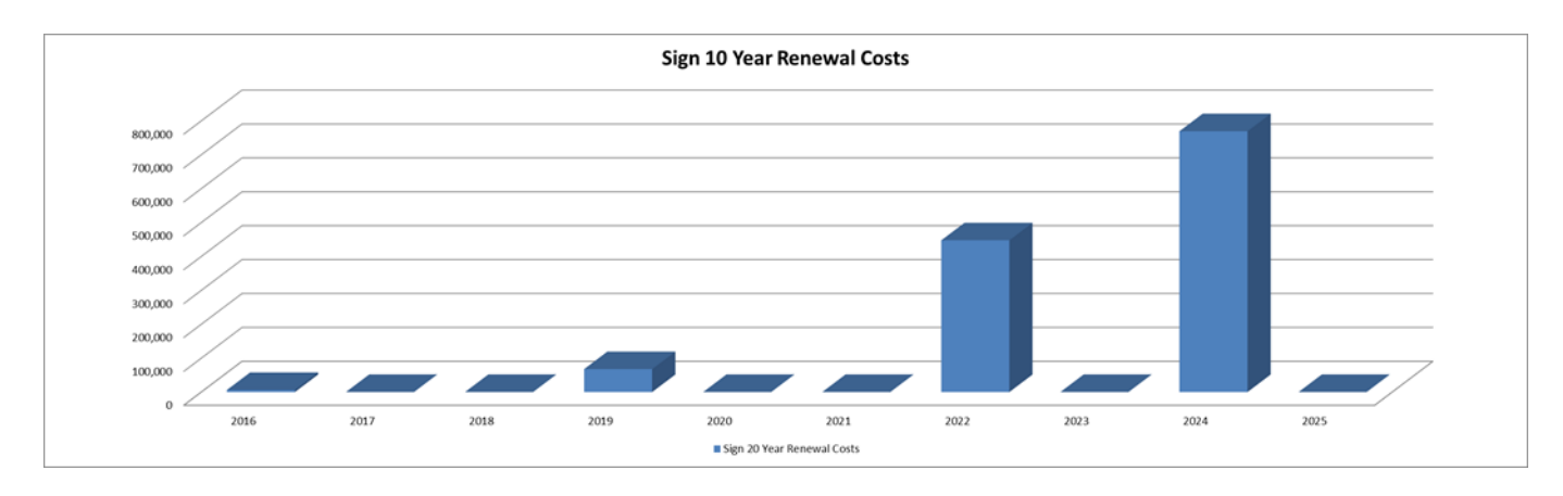
Table 3 below shows the figures for the first ten years of the asset management plan and shows an average amount of $129,042 p.a. This is less than the comparative figure of $180,013 p.a. over twenty years. The ten year percentage of overall replacement cost per annum is 5.59%.